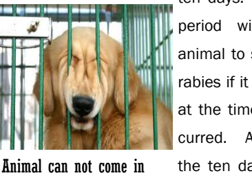
Animal can not come in contact with any other animal until quarantine has been released.

The animal must remain in guarantine for at least